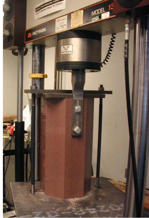
Test Setup for Bearing Hole Tests